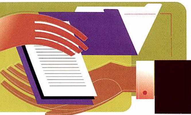
Down with Print page 18